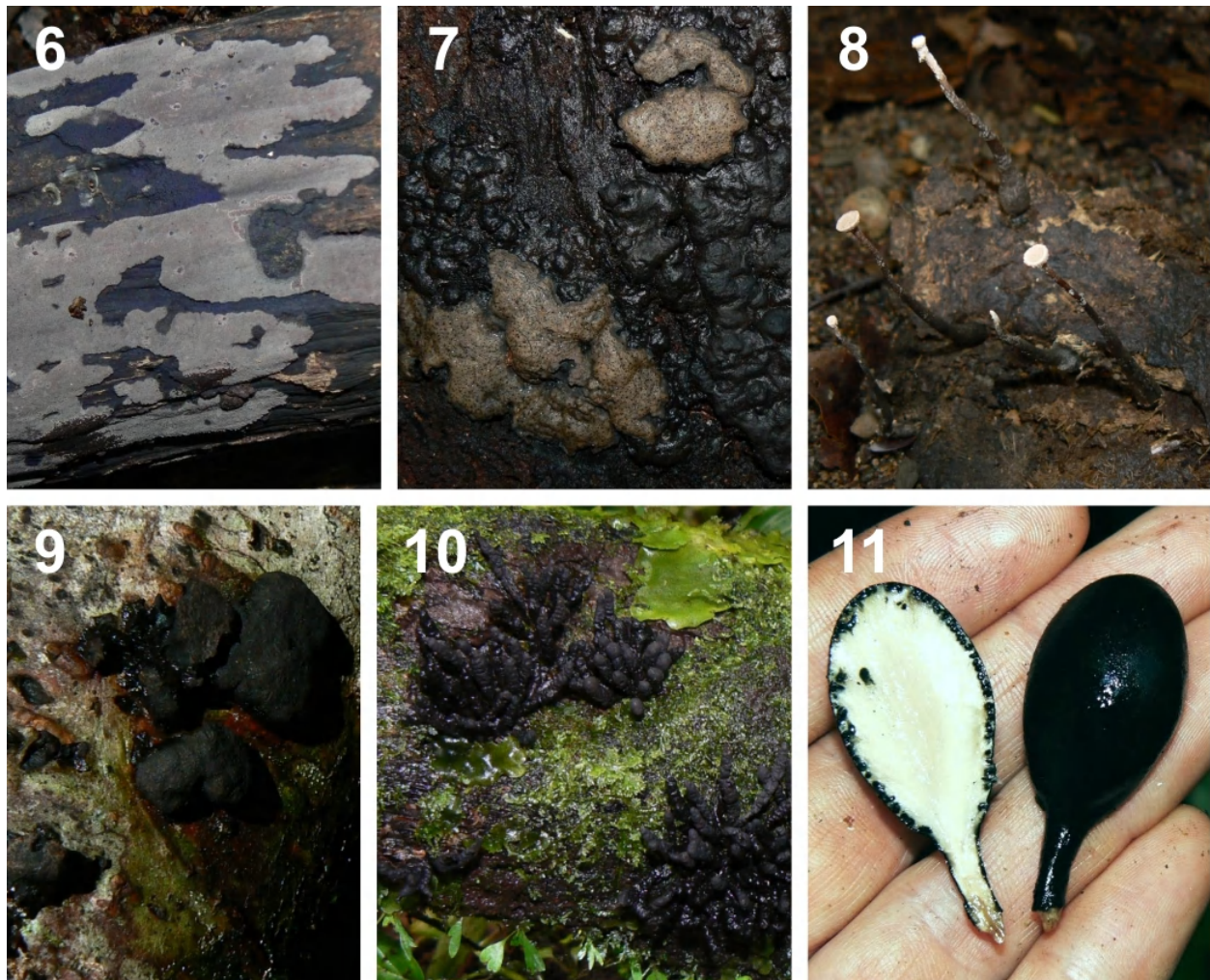
Species of Xylariaceae in the field in Panama. Fig. 6. Hypoxylon investiens (MP 4507). Fig. 7. Kretzschmaria sandvicensis (MP 4514). Fig. 8. Poronia oedipus (MP 4247). Fig. 9. Xylaria enteroleuca (MP 3976). Fig. 10. Xylaria fissilis (MP 3946). Fig. 11. Xylaria schweinitzii (MP 4000).